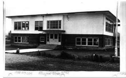
Raymer Avenue Elementary School

The original 241m 2 Raymer Elementary was constructed in 1948.